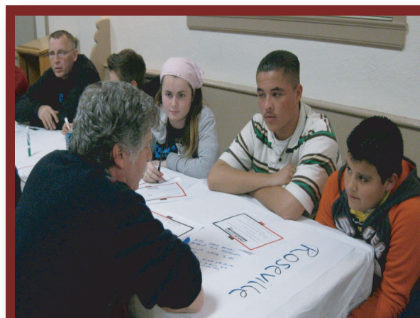
World Cafe - adults and youths share their views

A series of Town Hall Meetings on underage drinking followed the World Cafe, helping to spread the word and garner support for positive change.